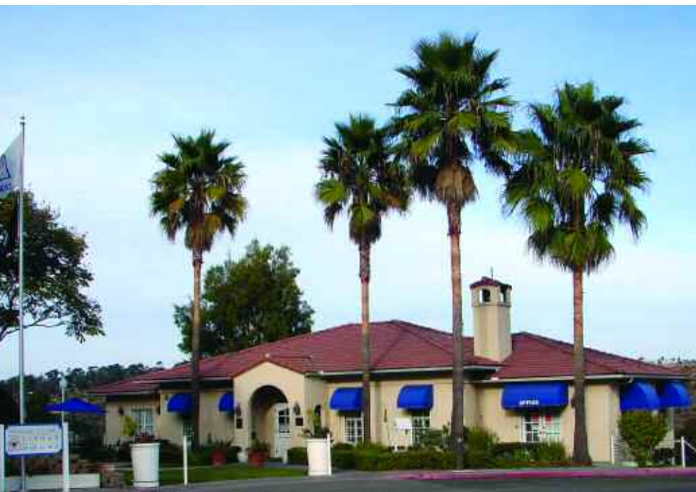
A Fisher House

Despite the high occupancy rates, families are rarely turned away. If they cannot be accommodated at the house, the house will work with other organizations (including the Fisher House Foundation) to make sure that their hotel expenses are paid. But the demand keeps growing. Fortunately, more houses are in the works. Right now, there are 38 houses and five more are under construction. At the San Diego Naval Base, a second Fisher