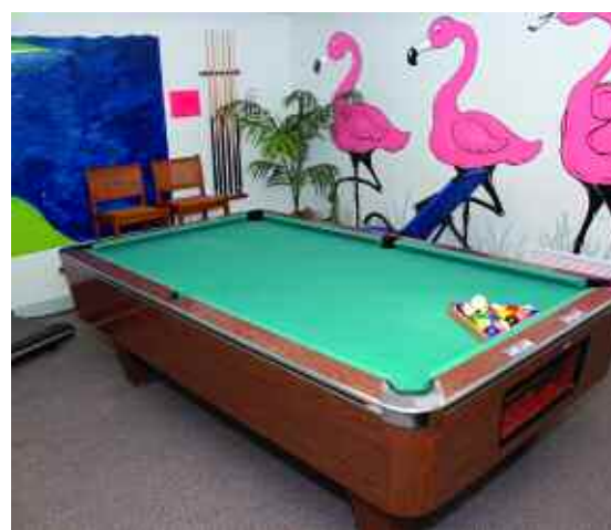
Fisher House living room, bedroom and common area

Due to her petitioning, the state board of liquor control refused to renew the bar's liquor license.