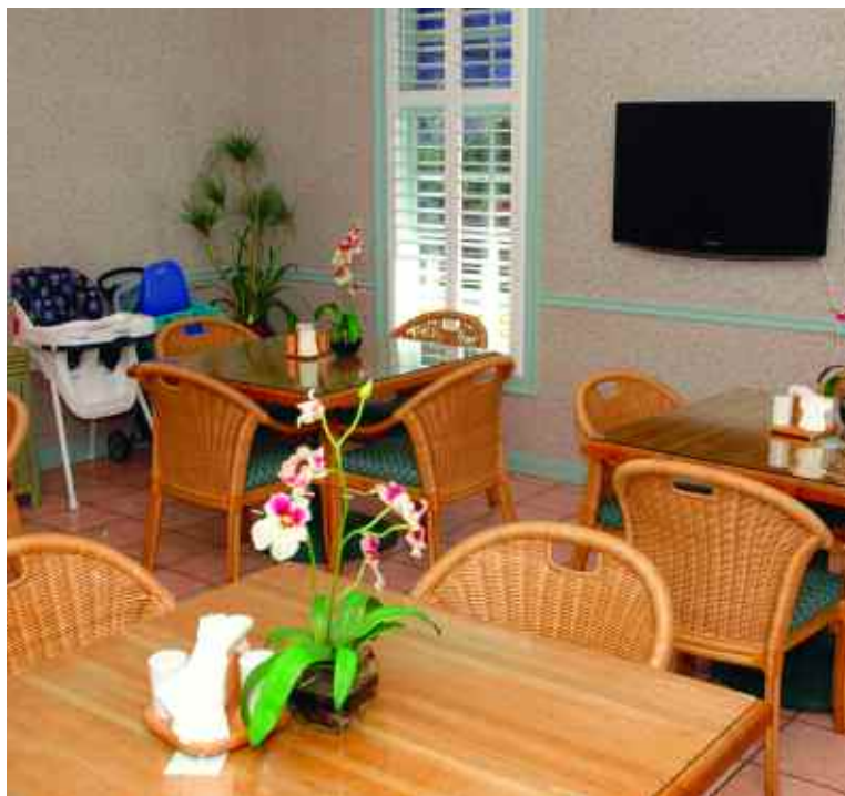
Fisher House dining room